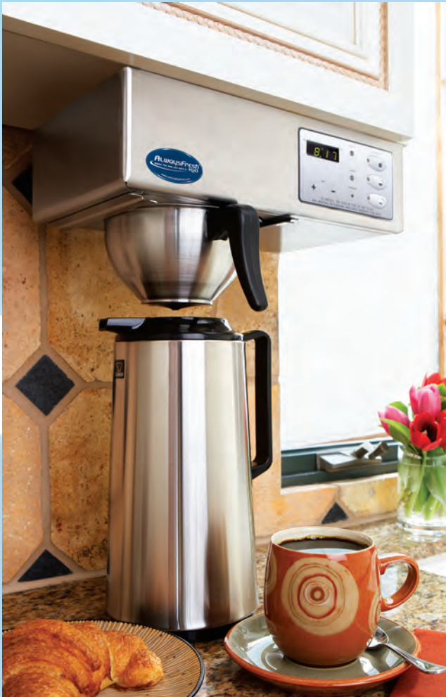
- AP-DWS-HFC 1000

Save Energy, protect the environment and enjoy Freshly Brewed water!